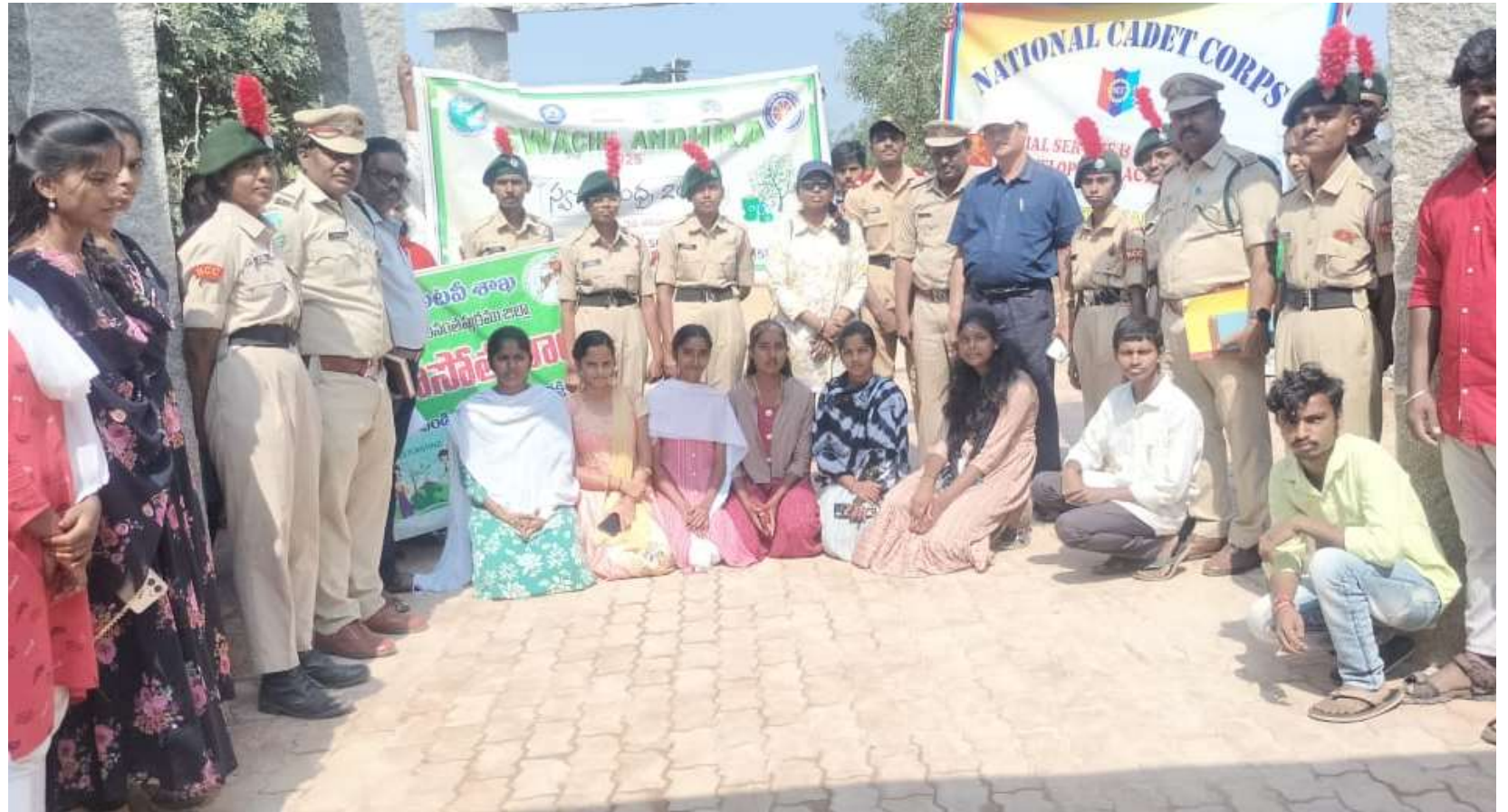
14. Nagaravanam visit under SASA by NSS& NCC 16.11.2025

The collective efforts of the students, faculty, and forest officials made the programme a grand success , reinforcing awareness about cleanliness, greenery, and environmental conservation.