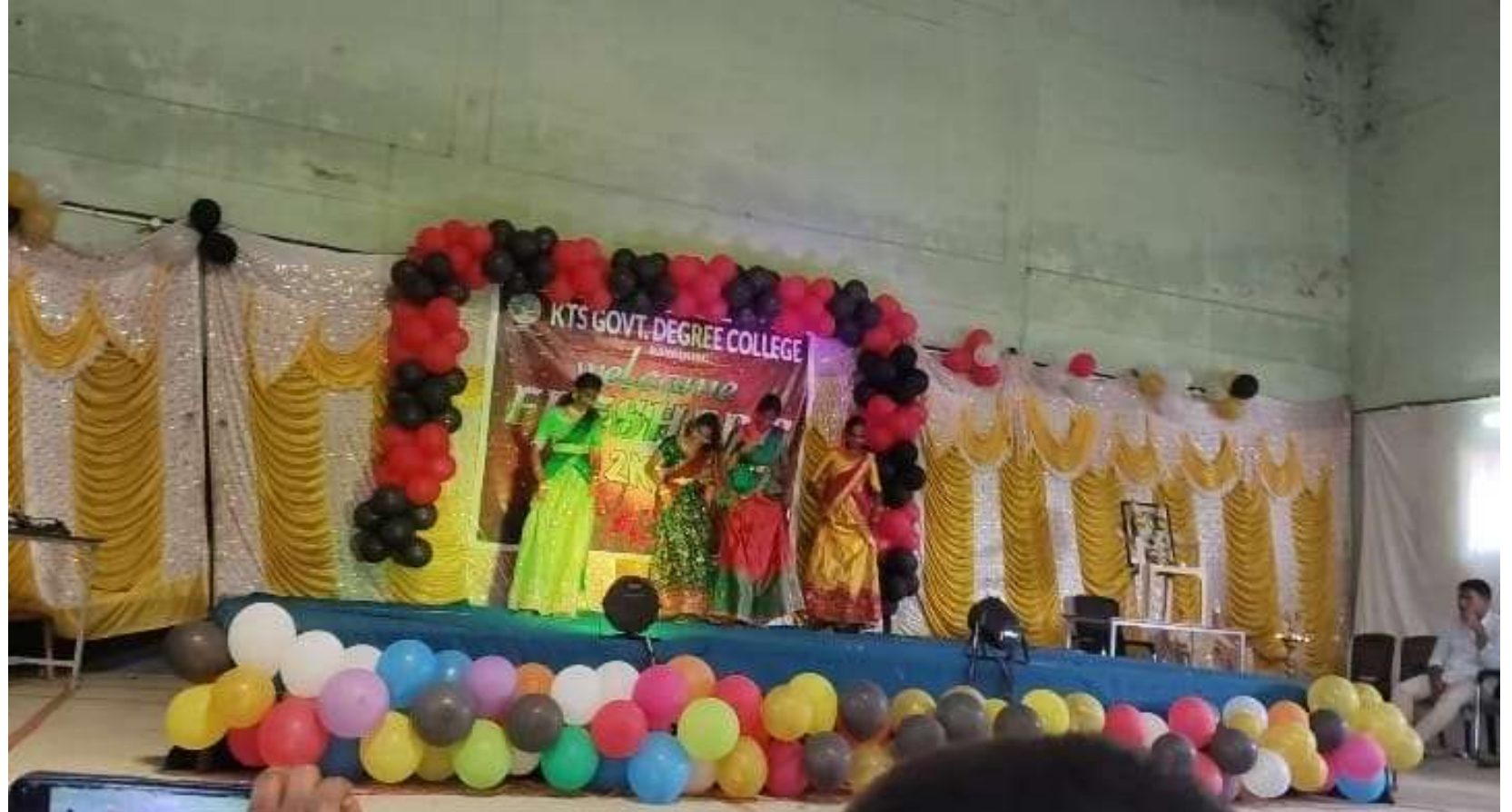
Cultural Programmes@Freshers' Day

At the end of the programme, the first-year students expressed their heartfelt thanks to the senior students and faculty members for the warm welcome and friendly support extended to them. The Freshers' Day celebration successfully created a positive and cheerful beginning to the academic journey of the new students and strengthened the bond between seniors and juniors.