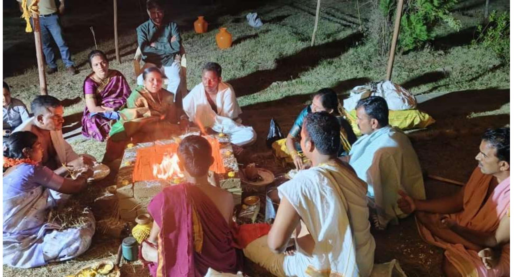
10. Homam for Saraswathi Temple Inauguration 13.11.2025

The ceremony was graced by the presence of the Principal, teaching and non-teaching faculty , and a large number of students , all of whom actively participated and contributed to the success of the event. The occasion reflected the strong bond between the alumni and the institution and highlighted the cultural and spiritual values upheld by the college.